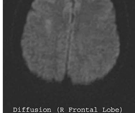
Fig 1. A , Axial FLAIR image shows large right frontal lobe white matter lesion. B , Axial T1 postgadolinium ( Post Gad ) image (same level as A ) shows patchy enhancement of right frontal lobe lesion indicating active lesion. C , Axial diffusion weighted image (same level as A ) shows slightly high signal intensity consistent with acute/subacute lesion.