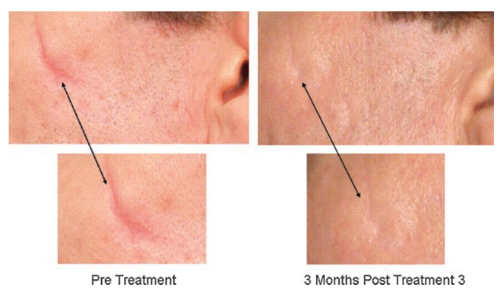
Fig. 2. Clinical image correlating to topographical primos image in Figure 1.

treatments received the highest improvement scores. All four of these subjects showed average overall improvement in the 51-75% range 3 months after their final treatment. Ex vivo studies with this device have shown tissue ablation and thermal effects as deep as 1 mm into the skin which may account for our success with severe scarring [11].